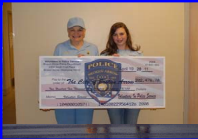
Volunteers in Police Service saved the city of Broken Arrow $209,829.75 in 2011