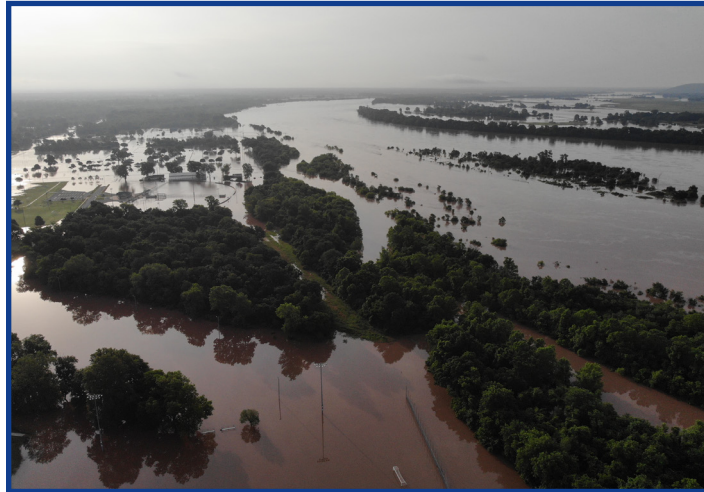
Most of Indian Springs Sports Complex was underwater during the peak of the flood emergency.