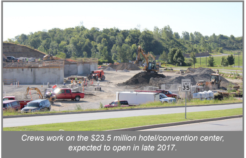
Crews work on the $23.5 million hotel/convention center, expected to open in late 2017.

Broken Arrow has long needed a large event facility that the entire community can use to host conferences, conventions, expositions and other events. The new hotel and conference center helps fill that void. It's estimated the new project will attract 5,000 to 10,000 out-of-state visitors each year. Visitors have a tremendously positive impact on Broken Arrow's economy, as they book hotel rooms, eat out and shop in our stores.