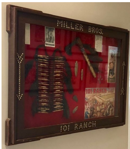
Displayed in our entry hall. On loan until September 1, 2019