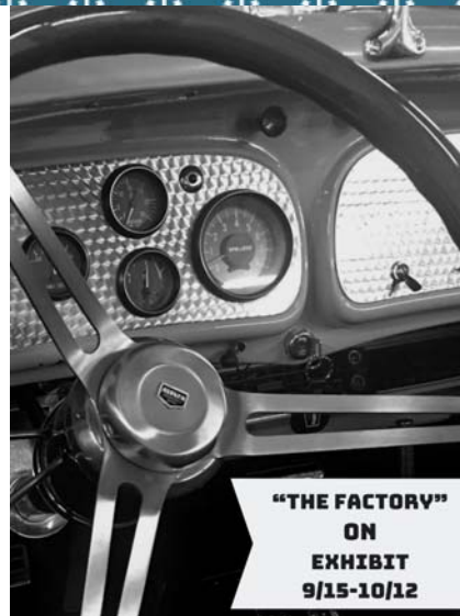
"THE FACTORY" ON EXHIBIT 9/15-10/12

display BBK exhibit hall through 12/14 24th Thursday Night Open Late 4-8PM