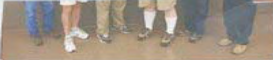
2017 TRIVIA CHAMPIONS