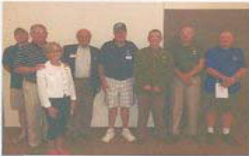
2015 TRIVIA CHAMPIONS