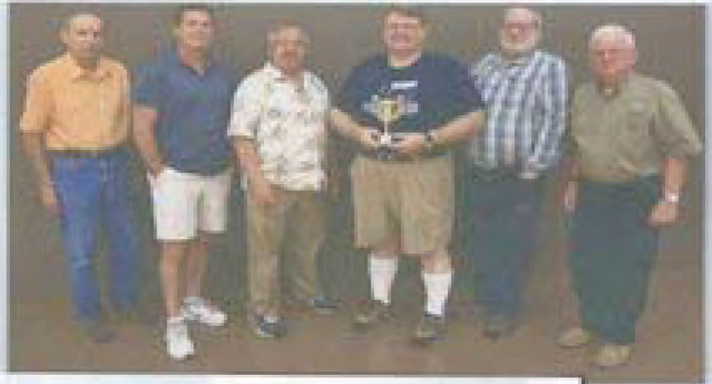
2016 TRIVIA CHAMPIONS